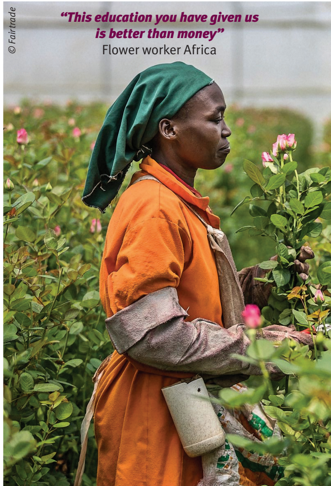
"This education you have given us is better than money" Flower worker Africa